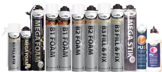
Part of the Bond It PU Foams & Adhesives Range

The data presented in this leaflet are in accordance with the present state of our knowledge, but do not absolve the user from carefully checking all supplies immediately on receipt. We reserve the right to alter product constants within the scope of technical progress or new developments. The recommendations made in this leaflet should be checked by preliminary trials because of conditions during processing over which we have no control, especially where other companies raw materials are also being used. The recommendations do not absolve the user from the obligation of investigating the possibility of infringement of third parties rights and, if necessary clarifying the position. Recommendations for use do not constitute a warranty, either expressed or implied, of the fitness or suitability of the products for a particular purpose.